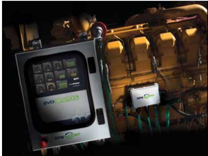
The GFS Corp EVO-SP™ 2600 System with its graphical user interface control panel.

GFS Corp is an innovative company and is committed to continuing to develop and offer the most advanced and sophisticated, alternative fuel technologies to users of high horsepower diesel engines. For more information, please visit www.gfs-corp.com . ■